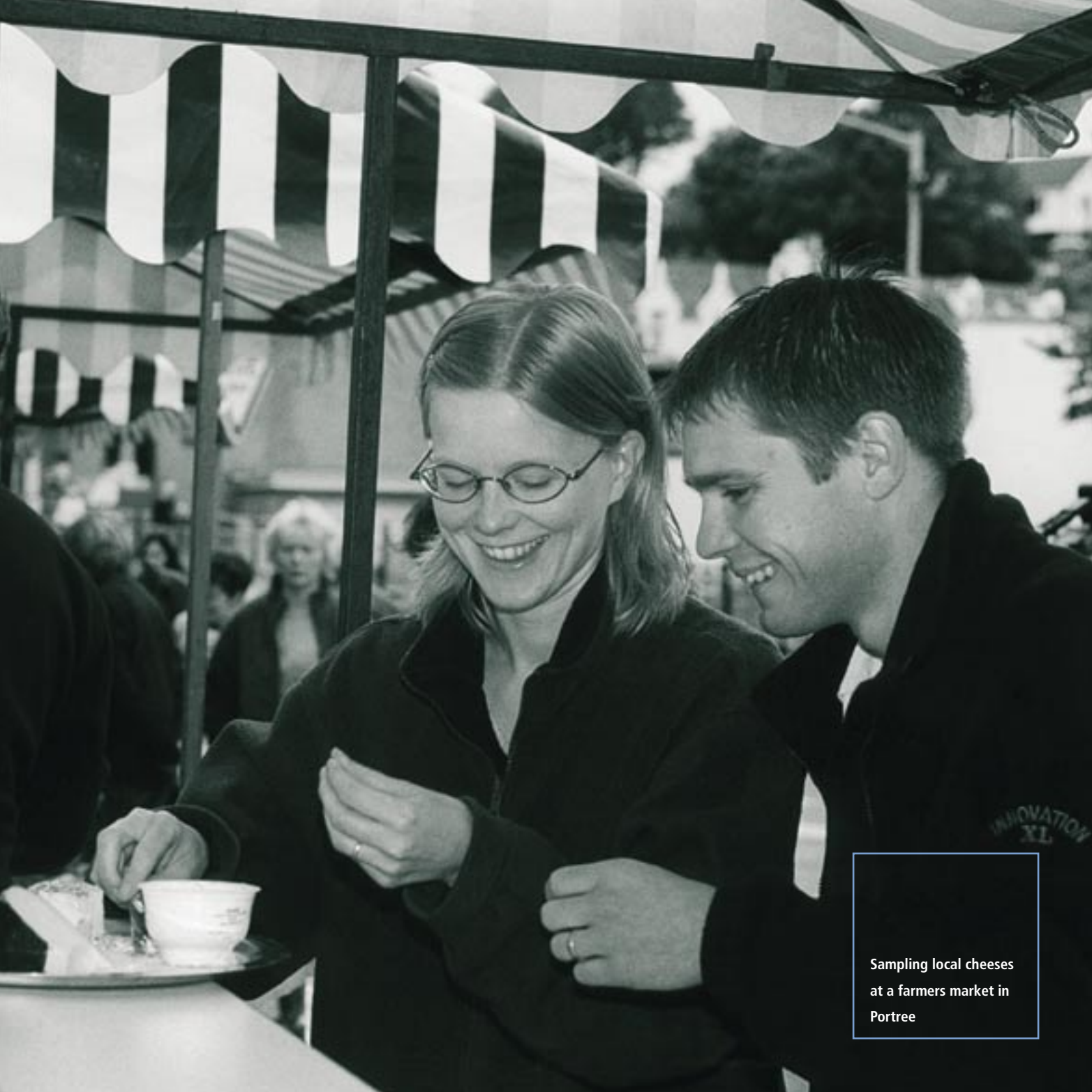
Sampling local cheeses at a farmers market in Portree